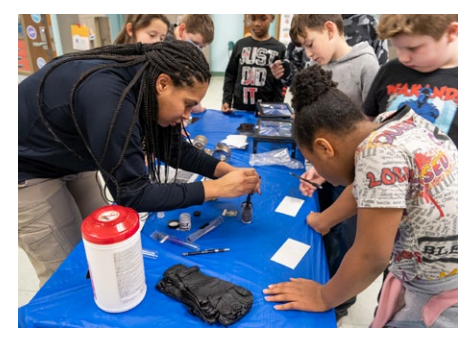
FBI Buffalo ERT members show students how to use magnetic powder to lift their prints.

More than 40 sixth graders in Niagara Falls, New York, participated in the recent Junior Special Agent Academy, led by FBI Buffalo and the Niagara Falls Boys and Girls Club. The program aims to give children the information, skills, and discipline necessary to stay away from gangs, drugs, and crime. Bureau personnel also shared ways law enforcement helps to serve and protect the community.