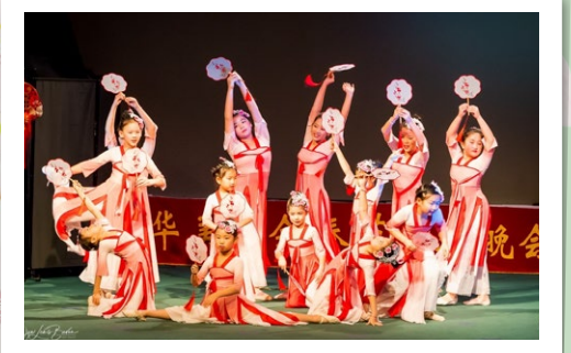
FBI Charlotte was honored to join the Chinese American Association of Charlotte to celebrate the Chinese New Year. The ceremony at East Voyager Academy for the Year of the Rabbit was beautiful.