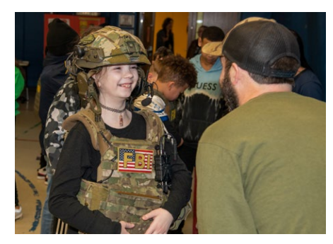
An FBI agent speaks to a student about the type of equipment he has to wear as a member of the FBI SWAT team.