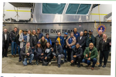
Recently, members of the FBI New York Citizens Academy Alumni Association visited the FBI's Tactical Training Facility in New York. Members had a meet-and-greet with special agents, received information on the evidence collection process, and viewed several tools used by Bureau personnel.