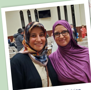
In February, the Buffalo Division attended an interfaith prayer service to show support for the Turkish and Syrian communities impacted by the devastating earthquake.