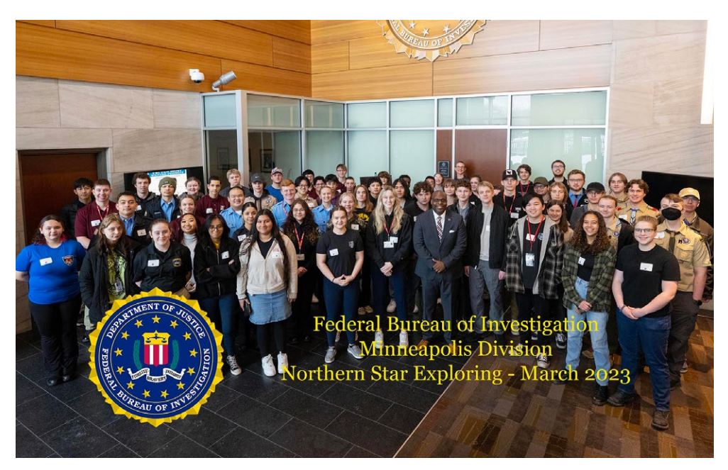
More than 100 Explorers, Scouts, and leaders and advisors attended the third annual FBI Minneapolis Mini-Academy. The full-day event featured FBI presentations, tours, networking, and a question-and-answer session.

In the afternoon, the group took turns visiting the gun vault, where several historical firearms are stored. The participants also enjoyed a tour of the SWAT room and the Bearcat vehicle. Bureau staff also provided information about the bomb technician career pathway and shared details about the FBI's drones, robots, and other specialized equipment used during operations.