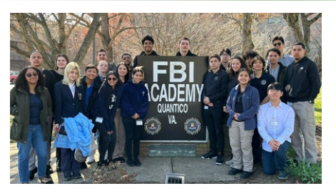
FBI New York coordinated a whirlwind trip to Washington for a group of 24 Explorers. During the visit, the group toured FBI Headquarters, the National Museum of African American History and Culture, the Marine Helicopter Squadron One, and the FBI Academy.