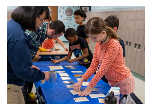
FBI Buffalo ERT members show students how to determine if something is blood using ERT techniques.