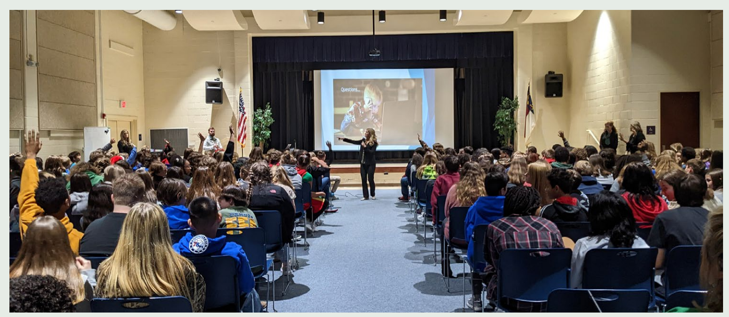
FBI Norfolk has hosted multiple informational sessions to help educate the community on internet safety. Each session, which draws up to 200 people, features information on sextortion, unsafe online activity, and how victims can report online crimes.

FBI Norfolk has six more presentations scheduled through June. ■