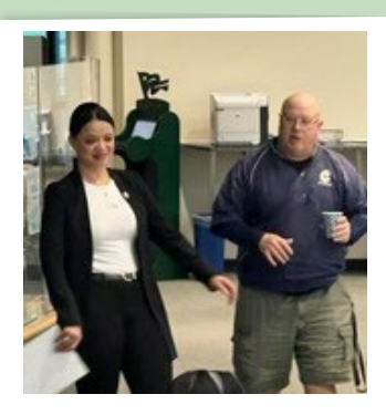
On Dec. 13, FBI Minneapolis hosted an opioid awareness session and panel discussion for a group of more than 100 eighth graders. Panel members, including an FBI special agent, shared information on how opioid use affects the brain.