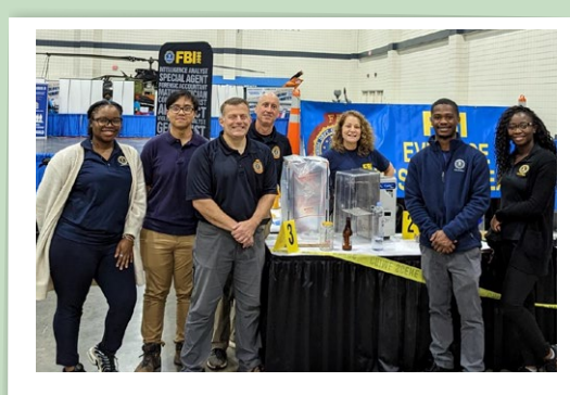
FBI Columbia participates in the Pathways to Possibilities South Carolina event Feb. 22-23 in Myrtle Beach, South Carolina. The event exposed 8,000 middle school students from across South Carolina to different careers. The Columbia Community Outreach Team and Evidence Response Team set up a crime scene, fingerprint activity station, and ERT equipment display.